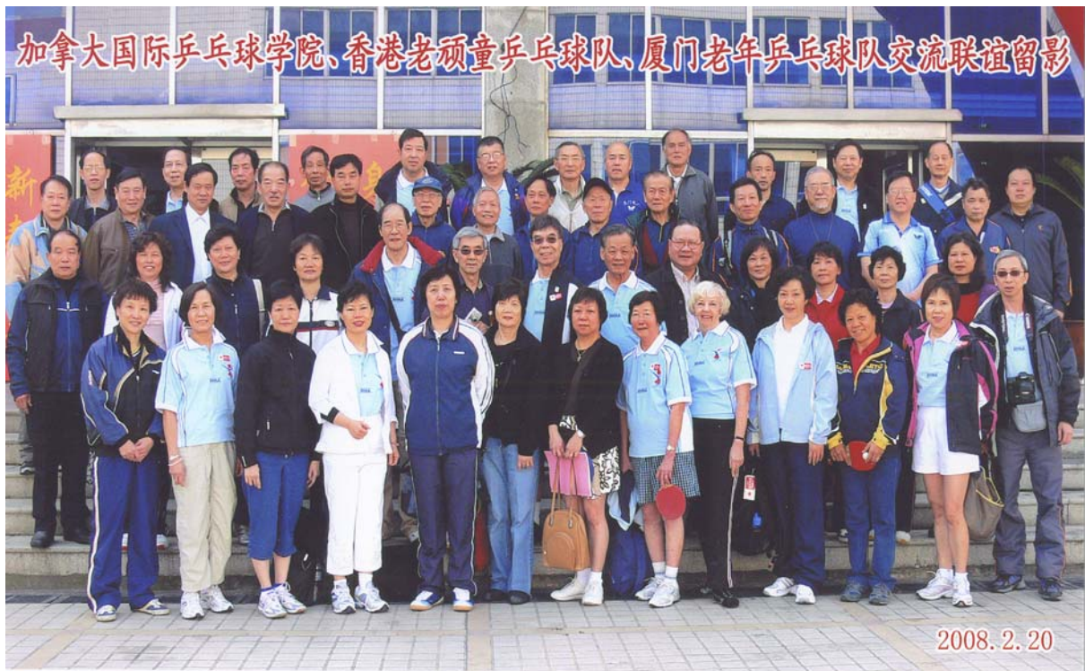
The Canadian visitors with some of their Chinese hosts at Xiamen. The sign reads "Canadian International Institute and Hong Kong and Xiamen players."